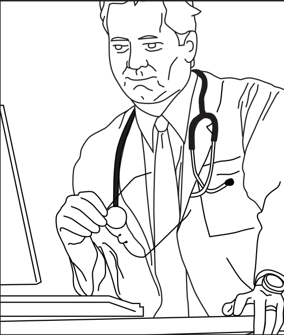
Focused on work