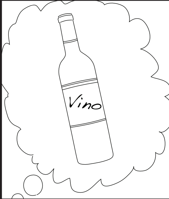
Not thinking about the birthday party and the bottle of wine he needs to buy.